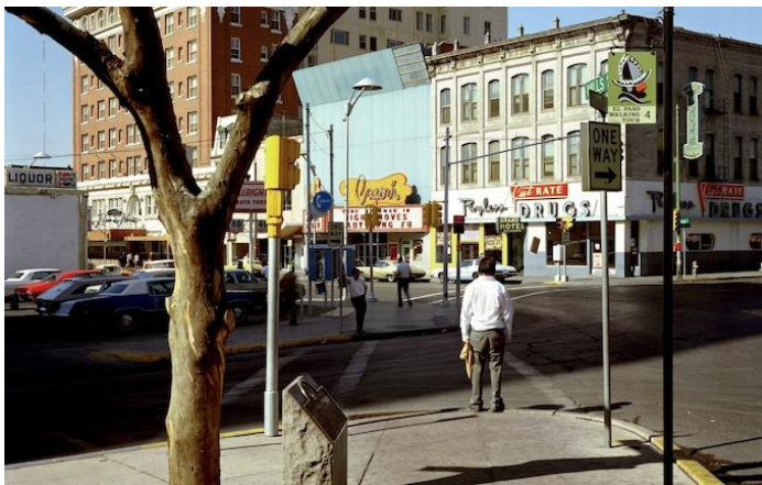
Stephen Shore, Landscape

Here are some photographers to get started: