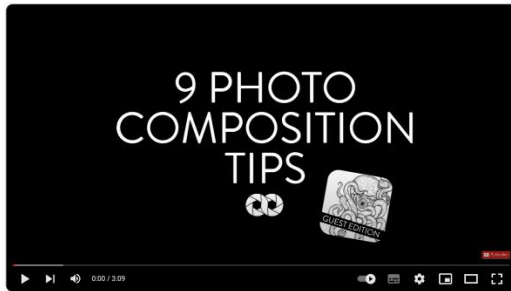
9 photo composition tips (feat. Steve McCurry)

Watch the following video and fill in the grid with the necessary diagrams and definitions.