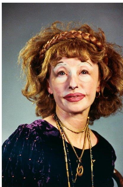
Cindy Sherman, Self Portraits