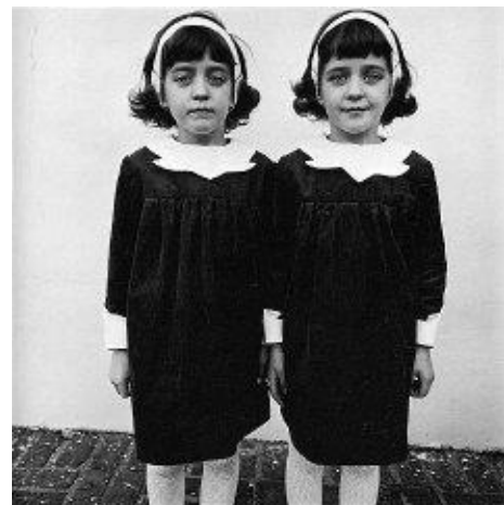
Diane Arbus, Portraits